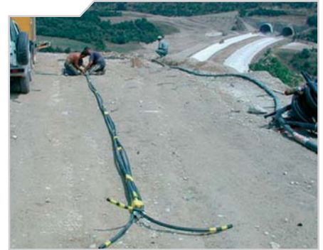
assembling of extensometers for a slope protection

Based on its experience in many major international projects, GEODATA is also your competent partner in planning and designing measuring programmes. Our trained staffs are naturally also very willing to train local personnel on site in installing measuring equipment and performing and evaluating measurement results. This also includes ongoing supervision and quality control of projects carried out by third parties.