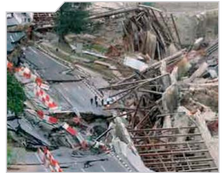
Tunnel collapse in Singapur

This procedure is known as "observational approach"