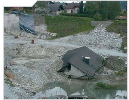
Result of a mine disaster