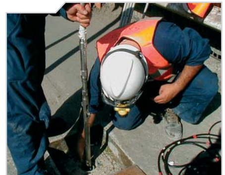
Sliding micrometer measurements during subway construction