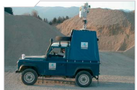
Scanner-measurements in a gravel pit

As a service, GEODATA offers profile measurements matched to the specific project situation and offers all the required components.