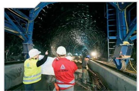
An accurate excavation profile avoids additional costs for concrete work

The captured measured values are displayed either online (KRIOS system), or transferred to an analysis computer and processed using the EUPALINOS software (theodolite measurements) or DEDALOS (scanner measurements). The results (profile plots, tunnel tapes, optimisations etc.) are presented in diagrammatic or tabular form.