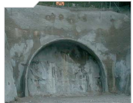
Permanent profil checks guarantee an optimised excavation profile for all construction phases