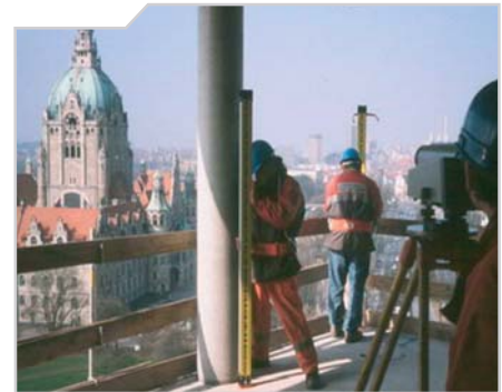
Levelling of high-rise building during construction