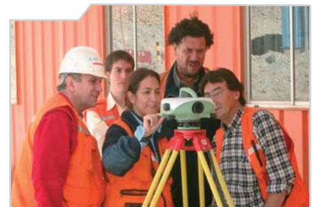
Training by customer order

The following other data sheets are associated with this data sheet: