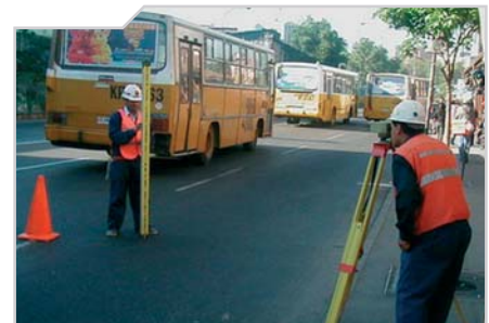
Precision-levelling during construction of Metro Santiago de Chile

In the case of tunnel construction near the surface, settlement measuring cross sections are often set up at regular intervals at the surface to observe the levels during the building phase. This procedure is also often used for monitoring undercuts or breaks in the face of unstable slopes. Our software also illustrates the relationship between surface settlement and underground displacements, which is of particular advantage for geotechnical analysis.