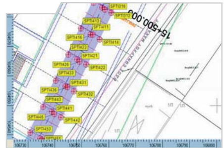
Visualisation of settlement monitoring sections by the software KRONOS