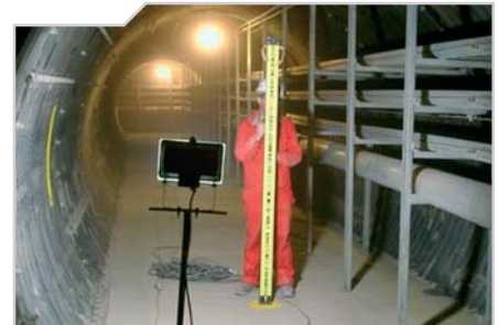
Line levelling in an utility gallery which is at risk of sliding

We can also offer automatic online height measuring systems for continuous monitoring!